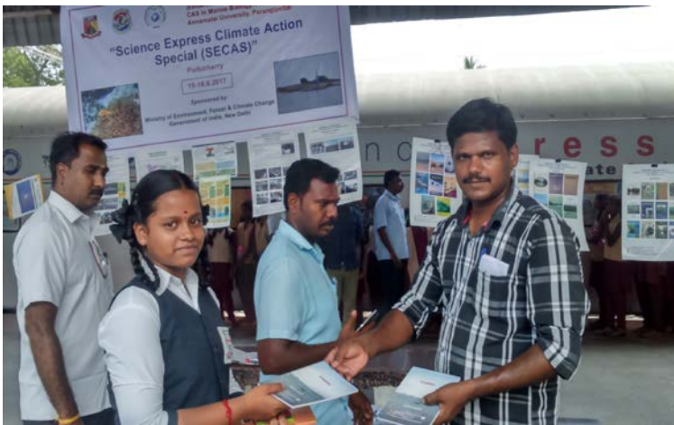
School students being briefed about the ENVIS activities during the Science Express Climate Action Special (SECAS) Exhibition in Puducherry. Conduct of essay and drawing competition, distribution of publications to the participants of the competition are also shown