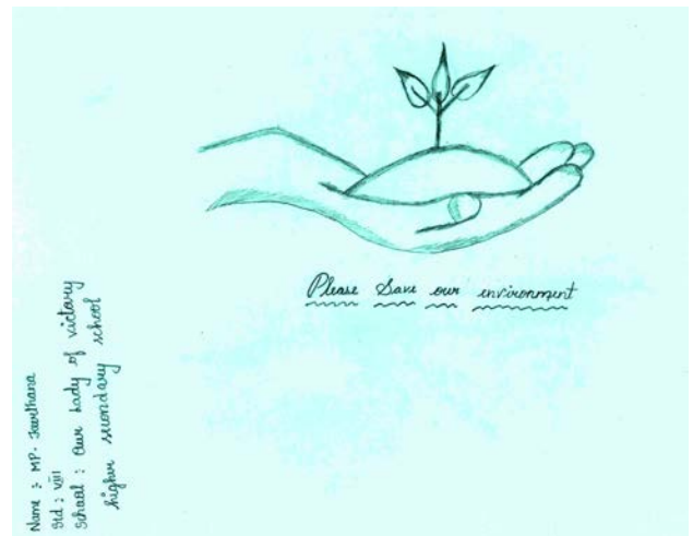
The essay and drawings

ENVIS-CENTRE LIBRARY St. A. Adithyana VIII - STD Our Lady of Victory H.S. School Environment In ancient days: In our ancient days everyone knew the importance of the trees. In ancient days there is no vehicles, plastic bags, smoking etc... so there is no pollution and no one can cut the trees and everyone love the nature. Ancient people getting food from the nature, cloths, bags etc from the nature. In medieval period: In medieval period people invented the bicycle and made things like chair, table bench with the help of wood. People found rubber and using rubber for shoes and for many things. From the medieval period the beginning of cutting trees is started.