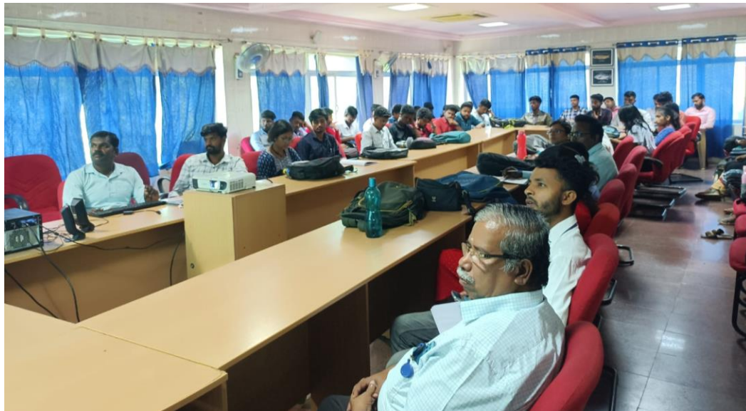
Fig. 5. Participants of the programme.